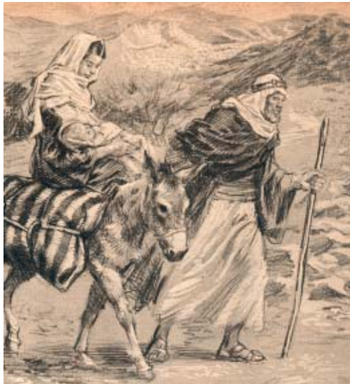
The Flight into Egypt.

Joseph fades from the pages of Scripture. What a mighty part Mary and Joseph played in the birth of the Redeemer, although the record of that part takes only a few verses of