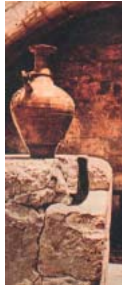
Mary's Well, Nazareth From "The Bible Story" April 1964, Fleetway Publications, London.

Brethren, let us put off in every possible way the old nature, and put on as thoroughly as we can the new nature created in us by the work of the Holy Spirit. God has made it possible for us. It is now up to us to do it in the strength He has given us. S